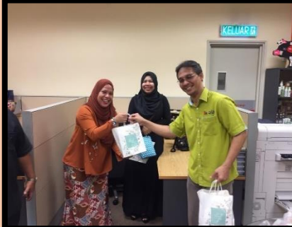
Souvenir giving ceremony

'MAJLIS BACAAN YASIN, TAHLIL, DOA SELAMAT DAN KESYUKURAN'