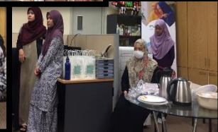
Feast after speech from top management