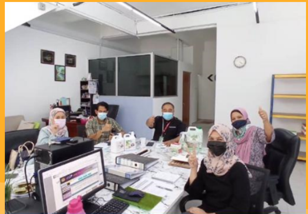
PREMISE VISIT DOCUMENTATION READINESS REVIEW GIFTED ICON SDN BHD 3 MARCH 2021