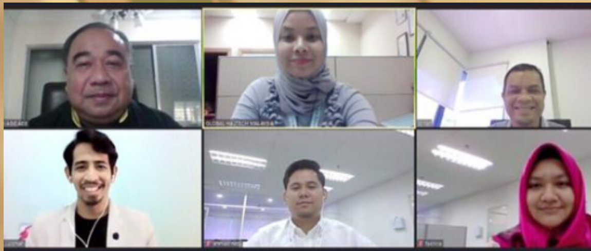
INTELLIGENCE AQUA SDN BHD 4 MARCH 2021 VIRTUAL COACHING COACHING NEED ANALYSIS ON HALAL FACILITATION