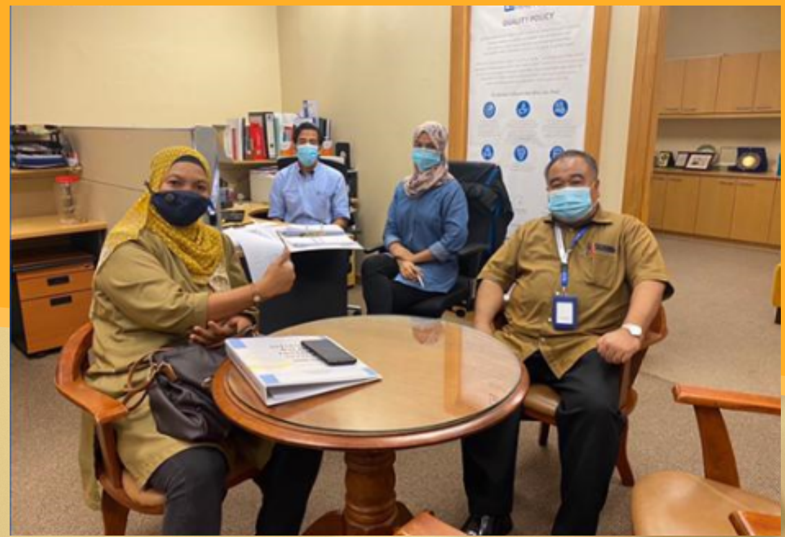
Gifted Icon Sdn Bhd 29 March 2021 Review on Halal Certification progress