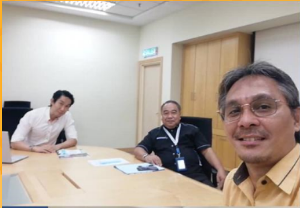
INTERNATIONAL PROJECT MALAYSIA AND JAPAN MEETING SLAUGHTER HOUSE INCORE KITCHEN MALAYSIA (KICCHAN CO LTD. JAPAN) 1 MARCH 2021