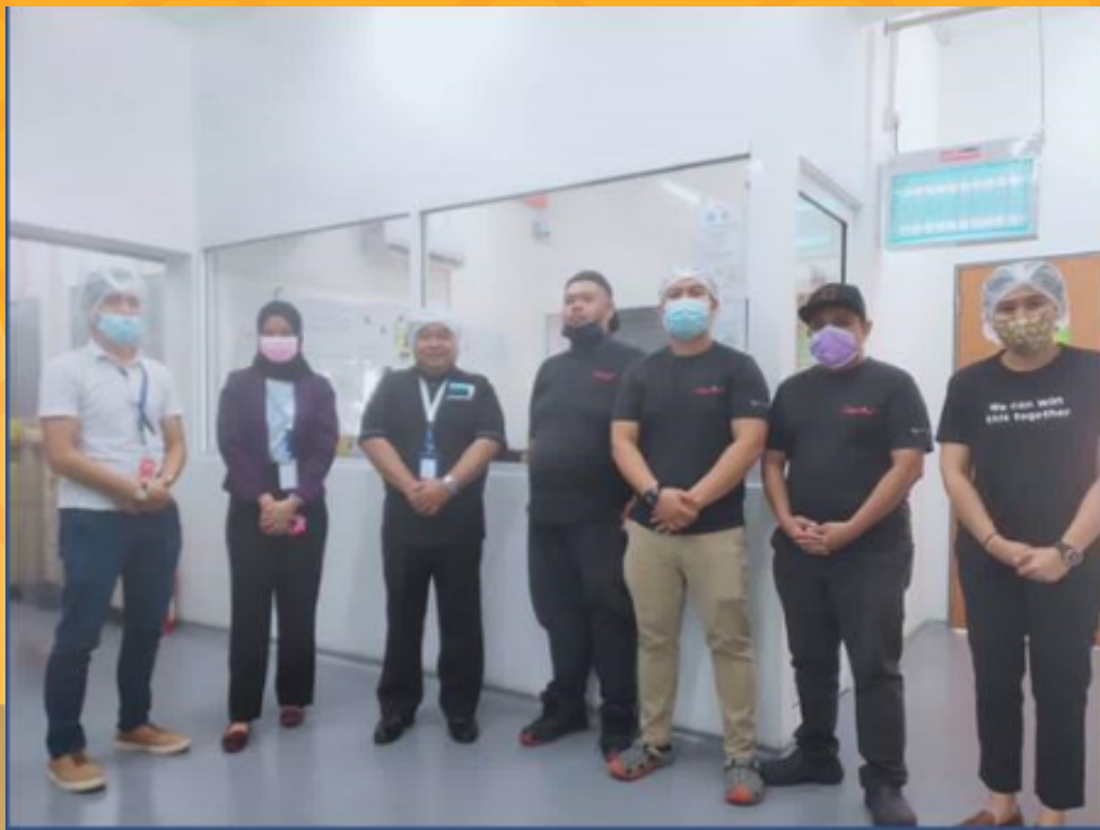
ANGGUN DINAMIK HOLDING SDN BHD 11 MARCH 2021 Coaching Need Analysis Halal Facilitation Certification Trust MyCatering Certification