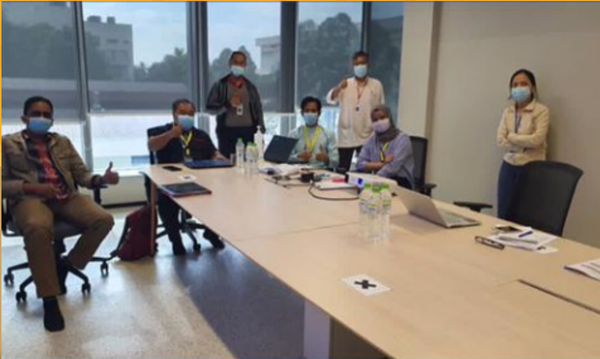
Najima Food Processing Sdn Bhd 26 March 2021 Coaching on Halal Facilitation