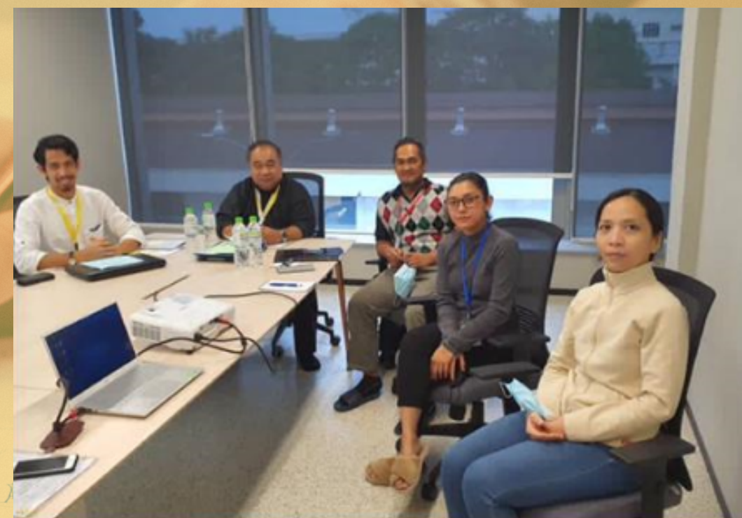
NAJIMA FOOD PROCESSING SDN BHD 12 MARCH 2021 Kick Off Meeting Gap Analysis on Halal Facilitation