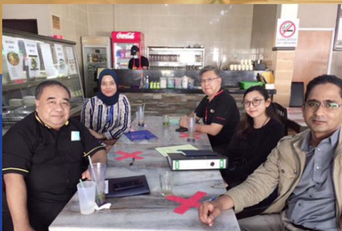
Najima Food Processing Sdn Bhd 10 March 2021 Halal Facilitation Consultation Proposal Agreement Coaching Timeline Review