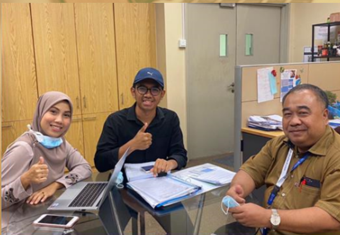
Superfood Biotech Sdn Bhd 29 March 2021 Halal Facilitation review Documentation readiness