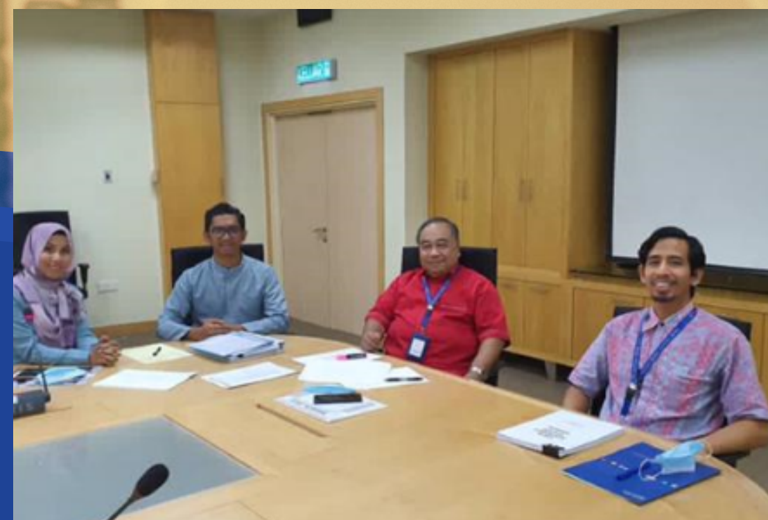
Superfood Biotech Sdn Bhd 25 March 2021 Documentation readiness Halal facilitation review