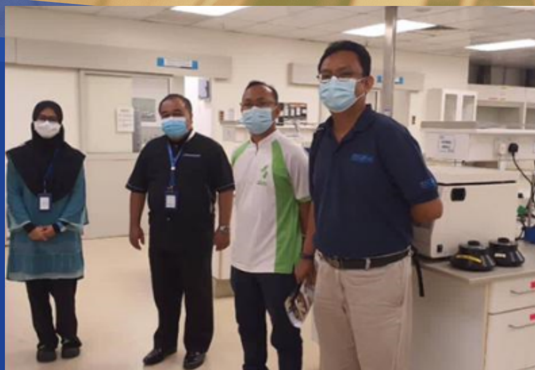
Waterco Far East Sdn Bhd 23 March 2021 Documentation readiness Halal facilitation review