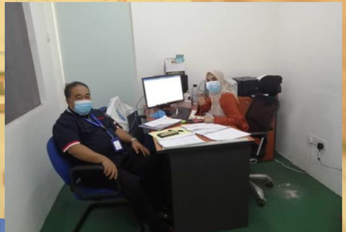
GMP/HACCP Coaching Facilitation Ecogrance Packaging Sdn Bhd GMP & HACCP final audit readiness & preparation 26 March 2021