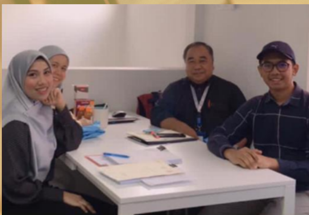
SUPERFOOD BIOTECH SDN BHD 12 MARCH 2021 Premise Visit Production Area Tour Documentation Readiness & Review