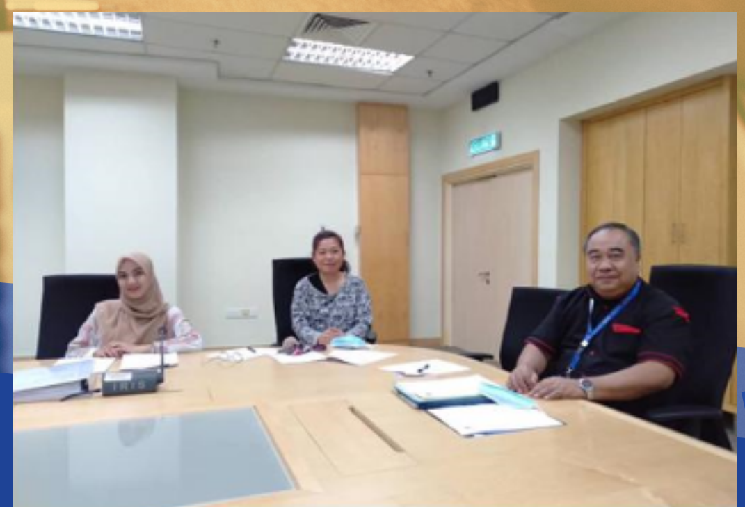
Ecogrance Packaging Sdn Bhd 5 March 2021 HACCP & GMP Consultation Documentation Readiness