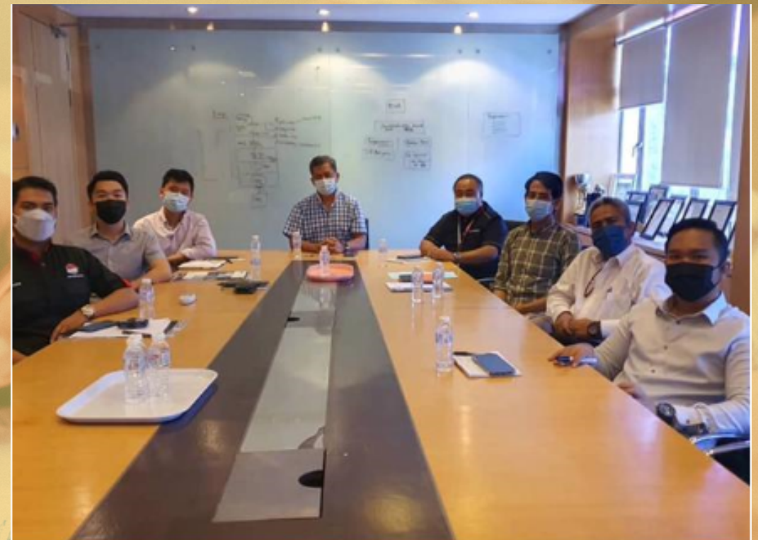
PINTAR HIJAU 3 MARCH 2021 GMP-NPRA BRIEFING MEETING