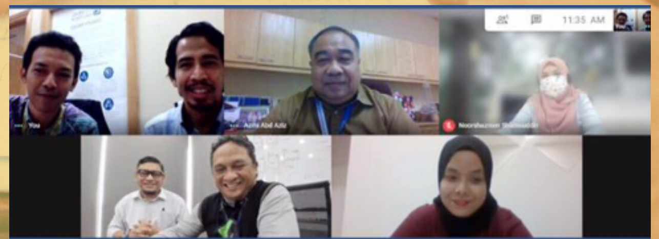
Cara Com My Sdn Bhd 29 March 2021 Meeting on Halciti Platform Development