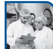
Professional Certified Programme