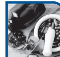
Halal Management Programme